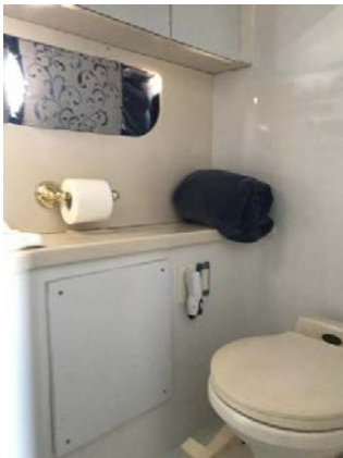
Aft head - Atlas Yacht Sales 904-501-1532