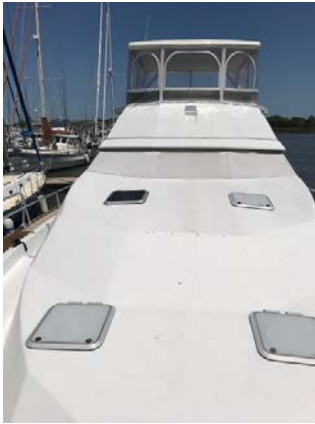
Bow looking aft - Atlas Yacht Sales 904-501-1532