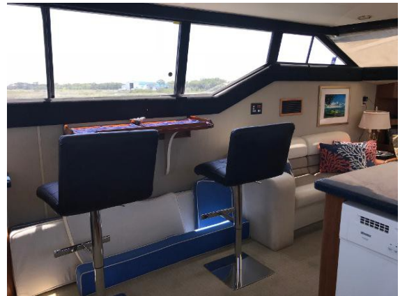
breakfast area - Atlas Yacht Sales 904-501-1532