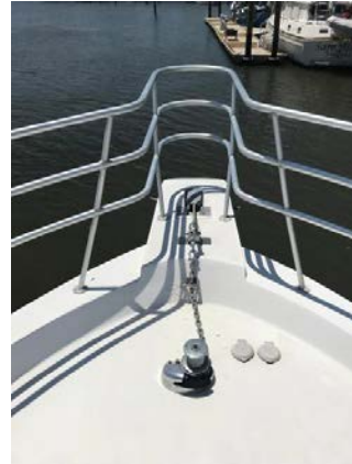
Bow with anchor and windlass - Atlas Yacht Sales 904-501-1532