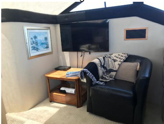
Salon - starboard - Atlas Yacht Sales 904-501-1532