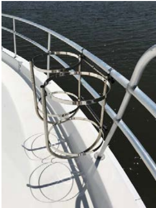
Fender holders - Atlas Yacht Sales 904-501-1532