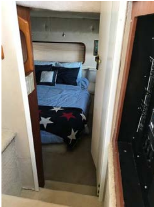
Aft cabin with (step down) - Atlas Yacht Sales 904-501-1532