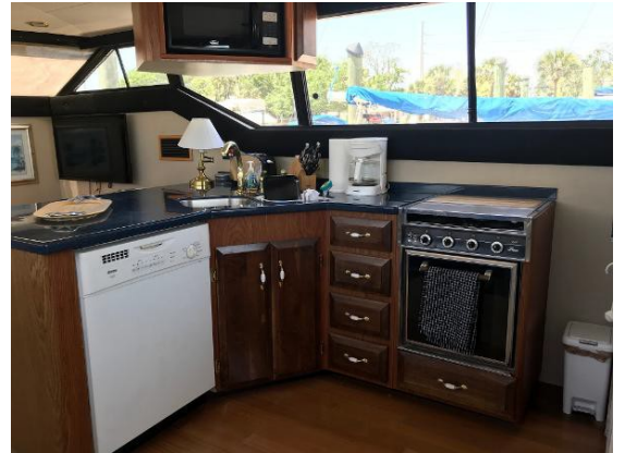
galley - Atlas Yacht Sales 904-501-1532