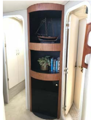
Bookshelf with storage - Atlas Yacht Sales 904-501-1532