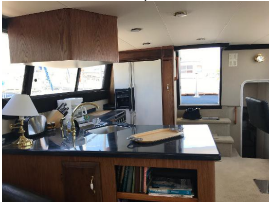
Looking aft at galley - Atlas Yacht Sales 904-501-1532