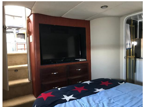
Aft cabin with TV and storage - Atlas Yacht Sales 904-501-1532