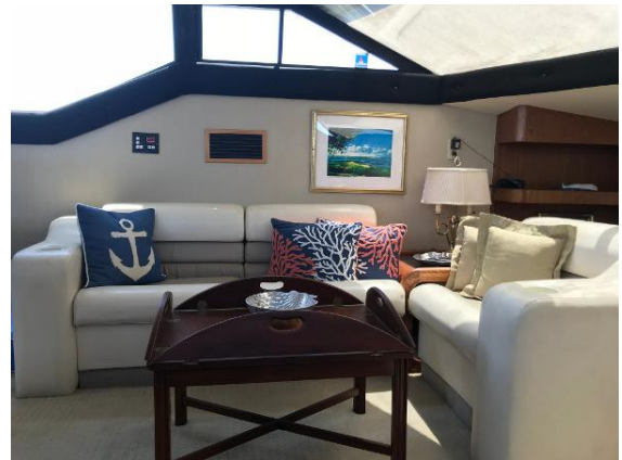
Salon port side - Atlas Yacht Sales 904-501-1532