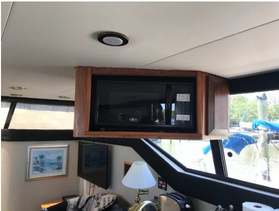
Microwave - Atlas Yacht Sales 904-501-1532