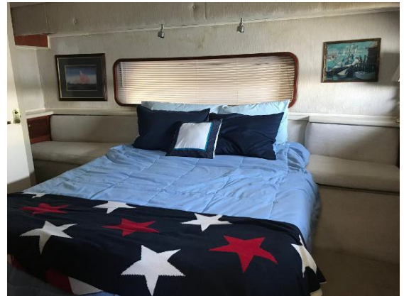
Aft Cabin centerline berth - Atlas Yacht Sales 904-501-1532