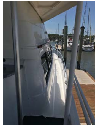
Side deck - Atlas Yacht Sales 904-501-1532